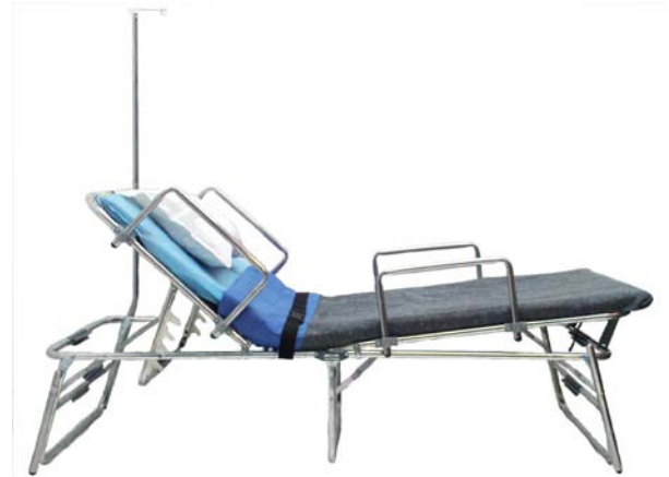
Shown with Optional Safety Rails and Disposable Linens